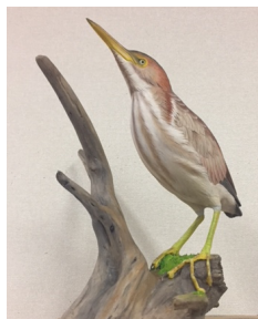
Least Bittern